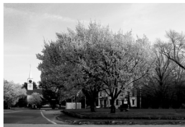
Spring in Norwell Center.

Support from the community also keeps The James on secure financial footing. The Trustees and staff take the stewardship of our historic building as seriously as do our supporters.