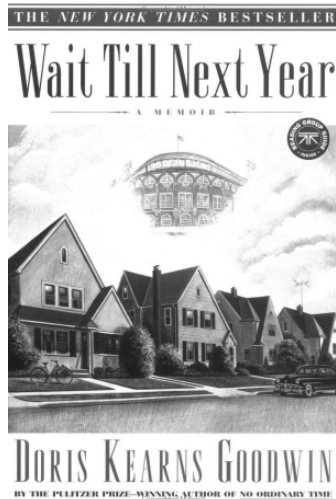
The 2009 book selection

A highlight of the month-long Norwell Reads program will be a baseball game with the Old Time Baseball League of the South Shore. The James will host a sports-themed story time for children on Tuesday, April 24 th at 10 a.m.